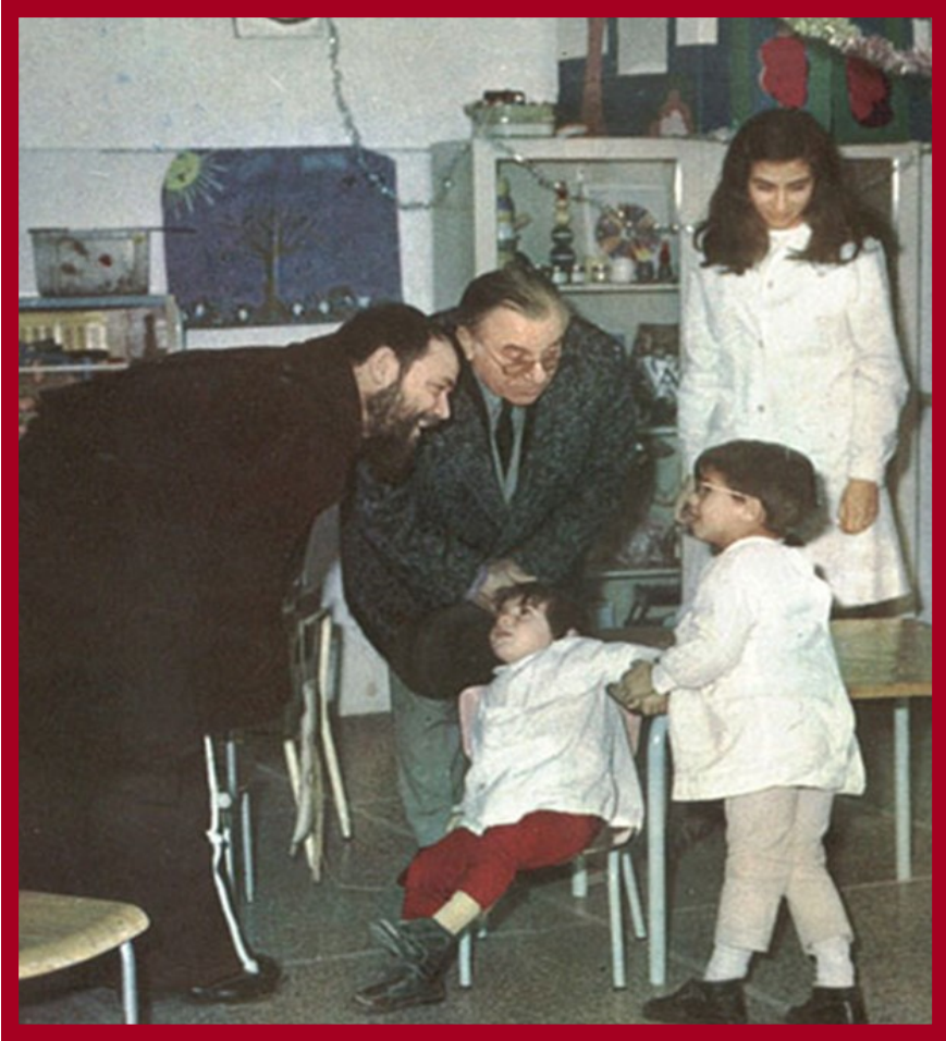
A photo of Carlo Campanini visiting patients at Padre Pio's hospital, "The Home for the Relief of Suffering."

their relatives. Carlo wanted to ask Padre Pio to pray that he could find work that would enable his family to be reunited. If it meant that he had to leave his acting career, he was prepared to do so. However, when he made his confession to Padre Pio, he could not bring himself to ask Padre Pio for anything.