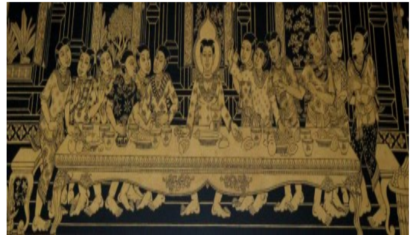
The Last Supper at St Nikolaus Church in Pattaya, Thailand

Blessed Nicolas Bunkerd Kitbamrung. Leaflet published by the Archdiocese of Bangkok: 2000