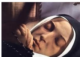
Saint Bernadette The Sleeping Saint of Nevers

PLEASE VISIT OUR WEBSITE: www.pamphletstoinspire.com