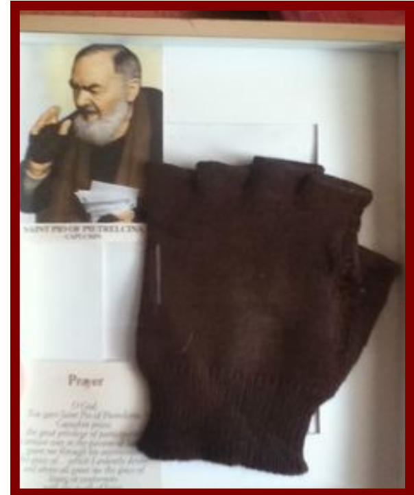
A glove worn by Padre Pio