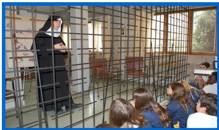
CLOISTERED MOTHERHOUSE OF BENEDICTINE NUNS

"Remember, I accompany you always and everywhere." St. Pio of Pietrelcina