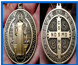
ST. BENEDICT MEDAL