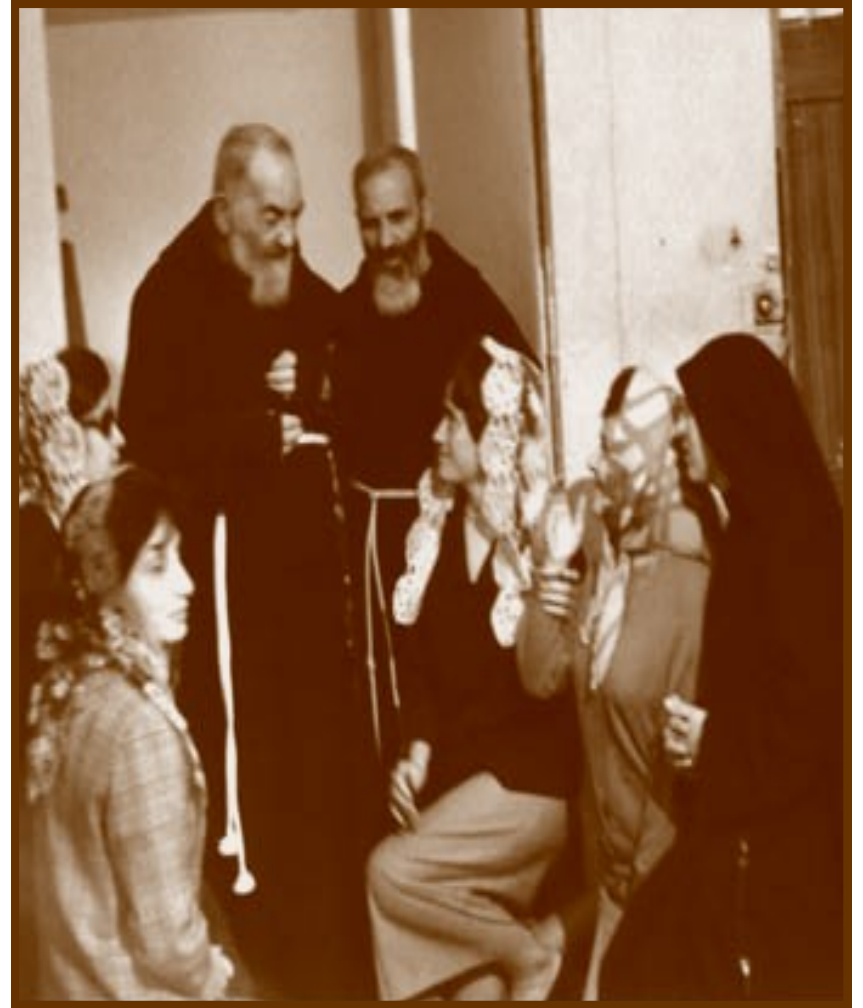
PADRE PIO MEETING WITH ONE OF HIS PRAYER GROUPS