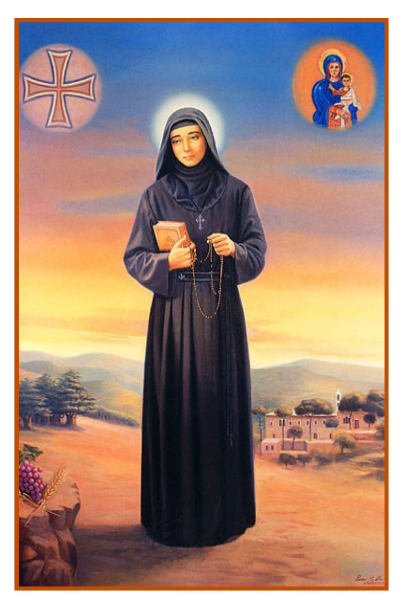
A ROLE MODEL IN THE ADORATION OF THE EUCHARIST