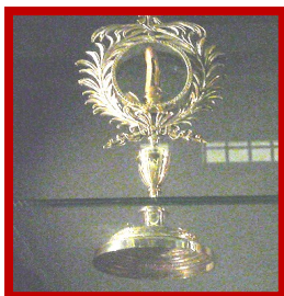
Reliquary containing the finger of St. Thomas. Rome, Italy

Finally, the disciples realize that Jesus' death and resurrection had a purpose and was predicted by Scripture. After years of confusion while sitting at Christ's feet, the teaching becomes clear. Then Jesus said: "With my authority, take this message of repentance to all the nations, beginning in Jerusalem: 'there is forgiveness for all who turn to me.' You are witness..." (Luke 24: 47-48).