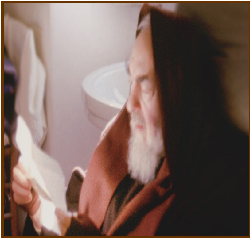
PADRE PIO READING A LETTER FROM A SPIRITUAL CHILD

FOR MANY MORE STORIES ABOUT PADRE PIO PLEASE VISIT THE WEBSITE: www.pamphletstoinspire.com