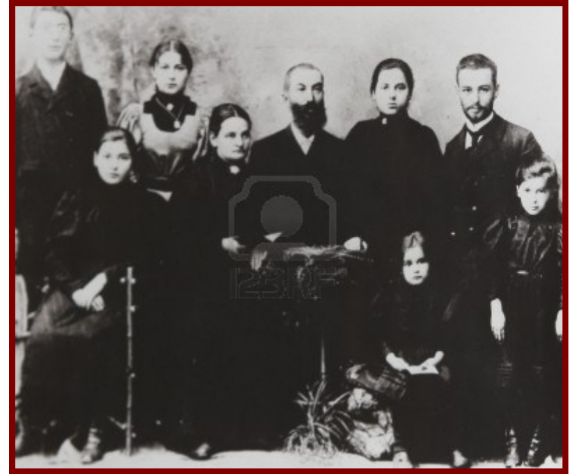
FAMILY OF EDITH STEIN 1891 — 1942

In 1911 she passed her exams with flying colors and enrolled at the University of Breslau to study German and history, though this was a mere "bread-and-butter" choice. Her real interest was in philosophy and in women's issues. She became a member of the Prussian Society for Women's Franchise. "When I was at school and during my first years at university," she wrote later, "I was a radical suffragette. Then I lost interest in the whole issue. Now I am looking for purely pragmatic solutions."