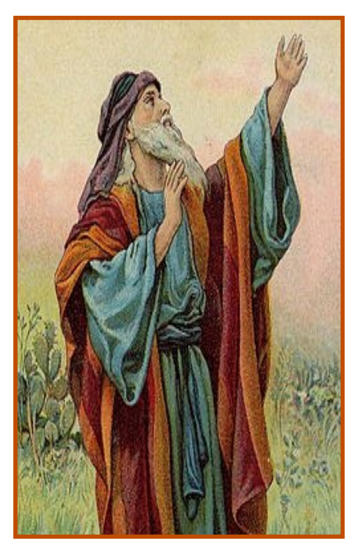
"THE SPIRIT OF THE LORD IS UPON ME" ISAIAH 61:1