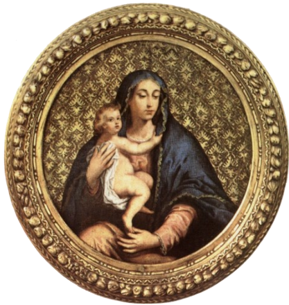
Our Lady of Purity Image in Padre Pio's cell