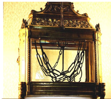
Reliquary of St. Peter's Chains located in Church of St. Peter in Chains, Rome, Italy

With one of his companions, Francis hastened to Pope Honorius III and prostrate, implored him to proclaim that every one visiting the church and confessing their sins with a contrite heart would be as pure from all sin and punishments as he was immediately after baptism. The Pope granted this petition. This indulgence has been extended to all parish churches throughout the world.