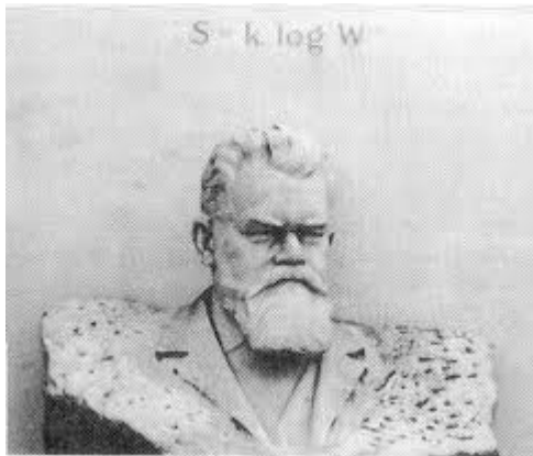
Boltzmann's Tombstone; the Equation S = k \log W is at the top and the bust is of Boltzmann

This equation (engraved on his tombstone—see picture—and tattooed on my younger son's arm) justifies the Second Law of Thermodynamics