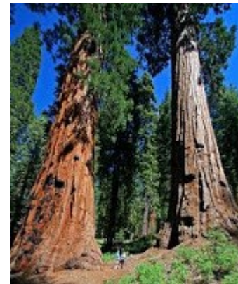
The "Big Trees" of Yosemite Park (note the small size of the person in the foreground.)

Aquinas also requires that which is beautiful be profound (he uses the term “large” or “big” but I think that can be construed as profound, as applied to beauty in science): “Beauty is found in a large body”. I think Aquinas also shows the connection between Beauty and God in his Fourth Way, (the fourth of five ways of demonstrating the existence of God), which can be stated using the conclusion of the syllogism given in the link, “Thus, there is something that causes the being and goodness of every perfection in all things, and this is God.”