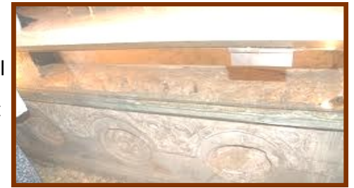
Tomb of Blessed Mother on Mount Olivet Site of the Assumption

about you by the Lord is fulfilled by your beautiful death, and made perfect in every way.