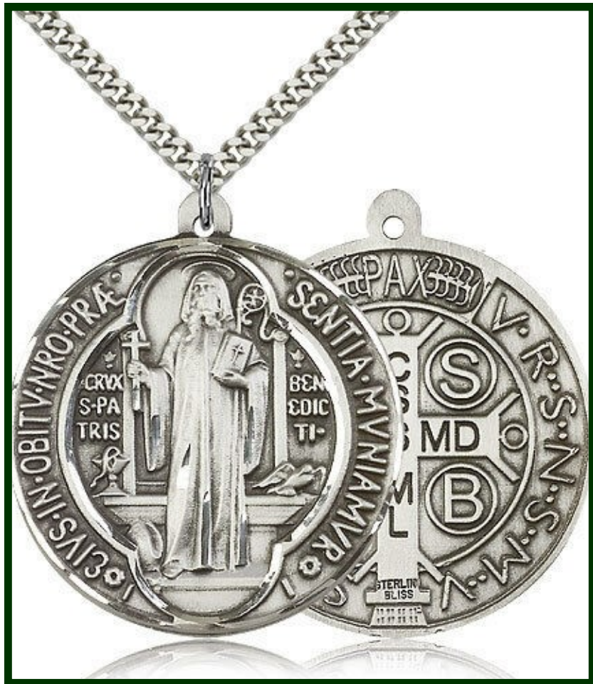
Saint Benedict Jubilee Medal