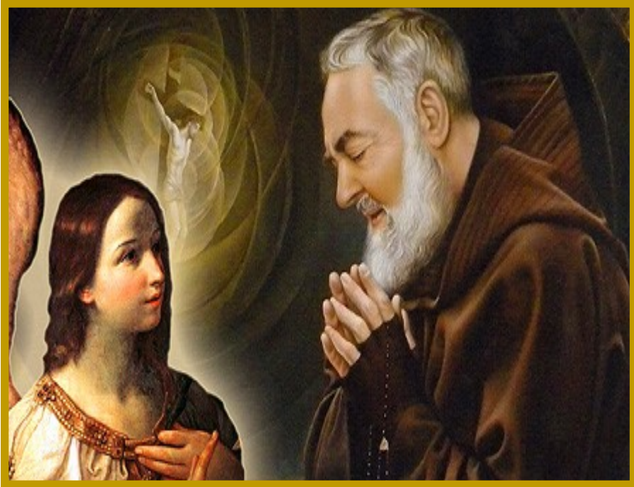
Padre Pio with his Guardian Angel

When Padre Pio died on September 23, 1968, several pilgrims who were in San Giovanni Rotondo reported to the Capuchins that they saw angels in the night sky. At the time of the sun's rising, the angels disappeared just as mysteriously as they had come. Knowing Padre Pio's lifelong devotion to the angels, one can hardly be surprised.