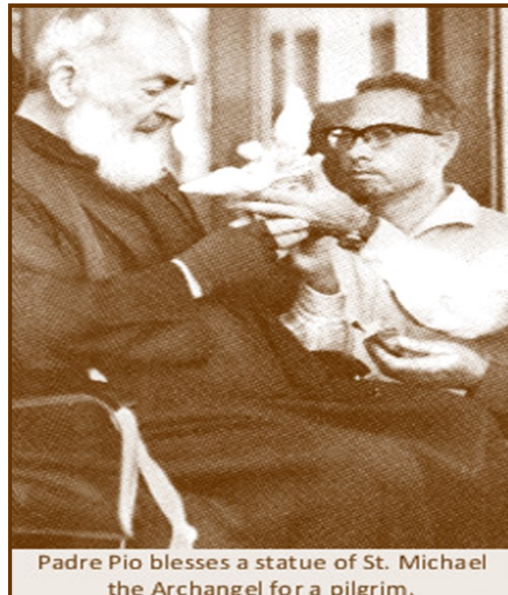
Padre Pio blesses a statue of St. Michael the Archangel for a pilgrim.