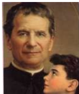
St. John Bosco and St. Dominic Savio

from: From The Houselops , pp. 35-42 Vol. XI