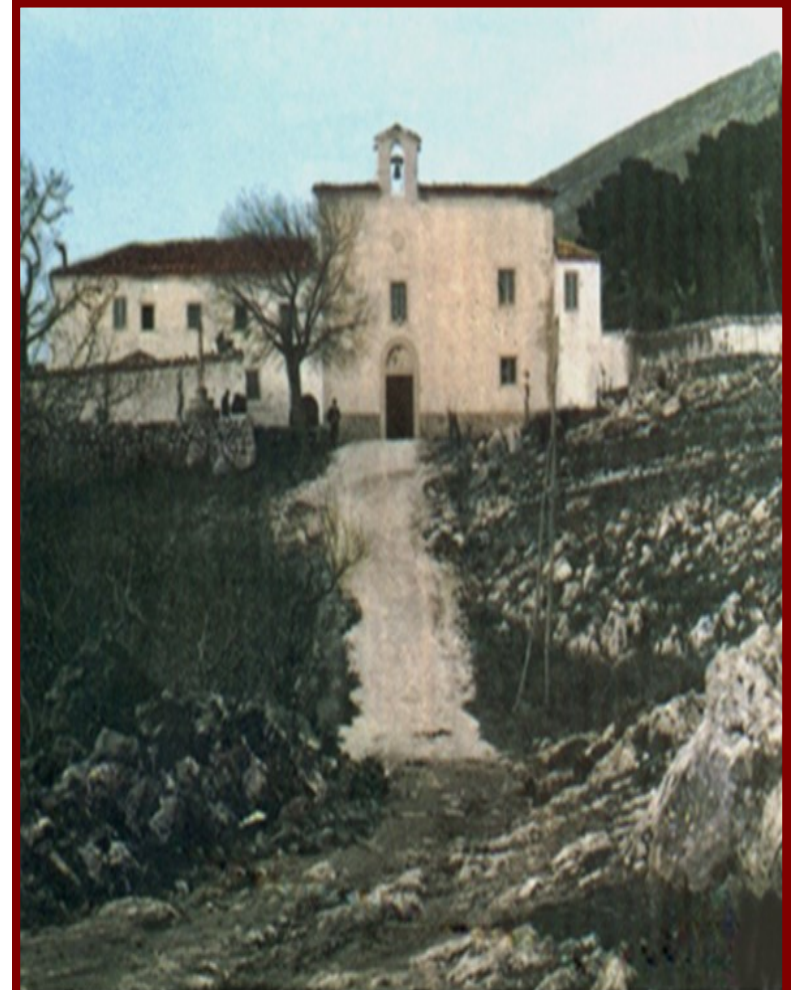
The friary where Padre Pio lived in San Giovanni Rotondo