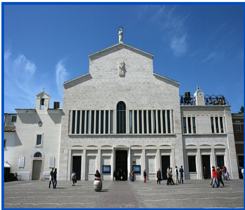
SAN GIOVANNI ROTONDO