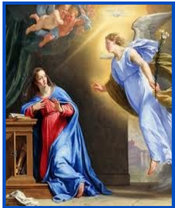
image in the person, and through His reflection the Father's glory shines forth. And as from the ever-flowing fountain the streams proceed, so also from this ever-flowing and ever-living fountain does the light of the world proceed, the perennial and the true, namely Christ our God. For it is of this that the prophets have preached: "The streams of the river make glad the city of God." And not one city only, but all cities; for even as it makes glad one city, so does it also the whole world. Appropriately,

Thou hast heard, O purest one, things of which even the choir of inspired men was never deemed worthy. Moses, and David, and Isaiah, and Daniel, and all the prophets, prophesied of Him; but the manner they knew not. Yet thou alone, O purest virgin, art now made the recipient of things of which all these were kept in ignorance, and thou dost learn the origin of them. For where the Holy Spirit is, there are all things readily ordered. Where divine grace is present, all things are found possible with God. The Holy Ghost shall come upon thee, and the power of the Highest shall; overshadow thee. Therefore also that holy thing which shall be born of thee shall be called the Son of God." And if He is the Son of God, then is He also God, of one form with the Father, and co-eternal; in Him the Father possesses all manifestation; He is His