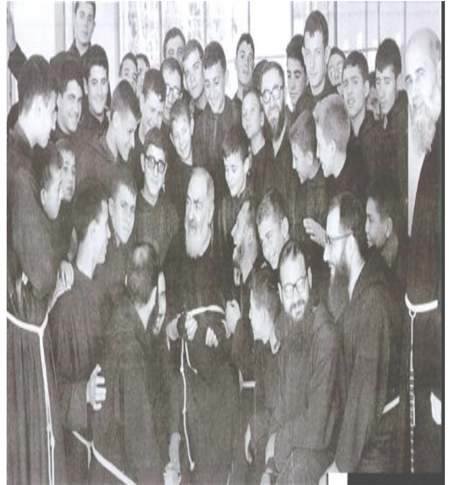
Students of the Seraphic College

Padre Pio on his part prepared himself by "the studying of ascetical books, especially Sacred Scripture;" he taught the college students with "conferences centered wholly on the love of the Lord on religious piety;" he taught them, by word and example, how to prepare themselves well "for holy Communion" and how to make a proper thanksgiving; he heard their confessions and prayed with them, so much so that one of the students, aspiring to the priesthood, considered that "his most important example as a teacher came from the choir loft," where he spent "long hours of the day and up until midnight in faithful adoration on his knees before Jesus in the Blessed Sacrament;" he assisted them like a mother during their illnesses; he accompanied them on their walks around the friary; he kept watch over them when,