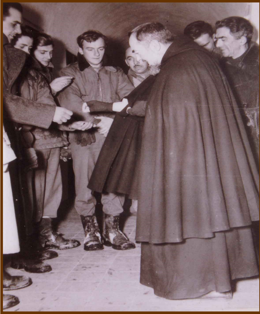
Padre Pio handing out Miraculous Medals to the Servicemen

The four months flew by and on 6 March 1918, he was back again in Naples. This time everything went as he hoped and on 16 March 1918, the document authorizing his rejection from the military because of double bronchial alveolitis, was signed.