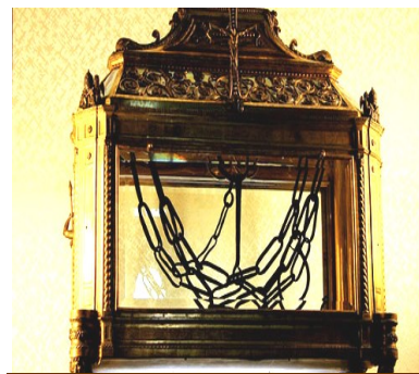
Reliquary of St. Peter's Chains located in Church of St. Peter in Chains, Rome, Italy

With one of his companions, Francis hastened to Pope Honorius III and prostrate, implored him to proclaim that every one visiting the church and confessing their sins with a contrite heart would be as pure from all sin and punishments as he was immediately after baptism. The Pope granted this petition. This indulgence has been extended to all parish churches throughout the world.